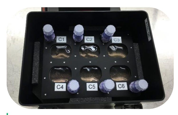
A view of the biocell that housed the heart cells on the space station.

"We're surprised about how quickly human heart muscle cells are able to adapt to the environment in which they are placed, including microgravity," Wu said. "Microgravity is an environment that is not very well understood in terms of its overall effect on the human body, and studies like ours could help shed light on how the cells of the body behave in space."