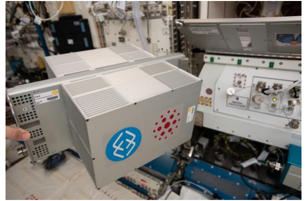
Fig. 3. The Organs-On-Chips as a Platform for Studying Effects of Microgravity on Human Physiology

The blood brain barrier (BBB) is a critically vital component of the body that serves as a gatekeeper between the circulating blood in the brain and extracellular fluid in the central nervous system (CNS). A model that allows monitoring of the dysregulation of the BBB could provide applications for studying neurological disorders as well as the transport of drugs and toxins to the CNS. To this effect, a team of researchers from Emulate is developing an automated BBB tissue chip platform derived from human cells for use both on the ground and on the ISS (see Fig. 3).