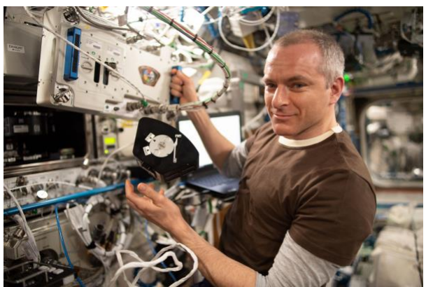
Fig. 1. Canadian Space Agency astronaut David Saint-Jacques works with the Cartilage-Bone-Synovium Tissue Chips in Space investigation.

A team of researchers from the Massachusetts Institute of Technology (MIT) is exploring putative therapeutics to treat post-traumatic osteoarthritis (PTOA). Utilizing a tissue chip system comprised of human cartilage, bone, and synovium that is challenged with inflammatory cytokines and an acute impact injury, the team will validate the system as an appropriate model for PTOA (see Fig. 1). Once validated, the team will use the model to test therapeutic options and monitor their effectiveness through the use of intracellular and extracellular biomarkers.