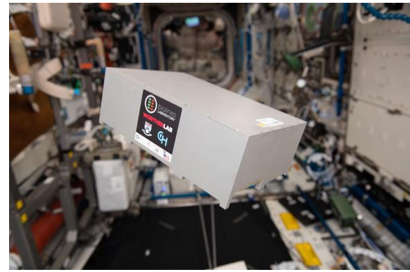
Fig. 4: The Lung Host Defence in Microgravity Chips in Space investigation hardware floats in the Destiny module of the International Space Station.

The innate immune response of humans allows for the recruitment of immune cells to an infected organ. A research team from the Children's Hospital of Philadelphia (CHOP) is developing a human airway tissue chip and connecting it to a bone marrow tissue chip. Using this interconnected system, the team can infect the airway chip and monitor the recruitment of neutrophils from the bone marrow as a model of innate response. Capitalizing on known spaceflight-induced changes associated with dysregulation of the immune system, this ISS project will serve as a model for a compromised immune system (see Fig. 4).