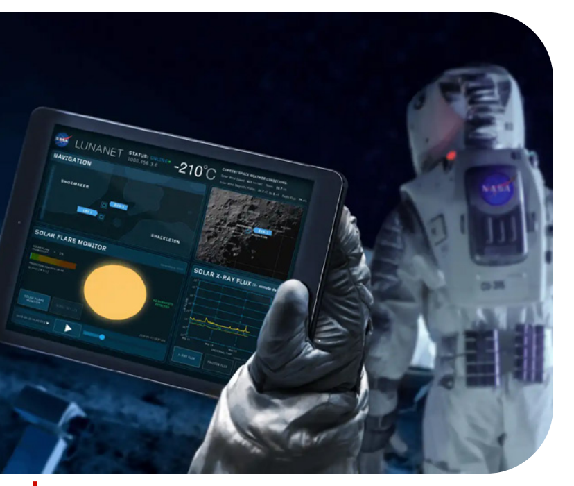
The future LunaNet will bring terrestrial Internet capabilities to astronauts, rovers, and orbiters.