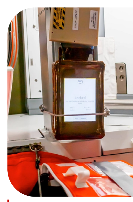
Amazon Snowcone onboard the ISS.

Using the DTN platform, the team successfully transferred multiple types of data to and from the ISS, including telemetry data, text commands and